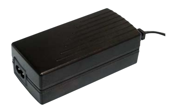
58 x 120 x 42 (mm)